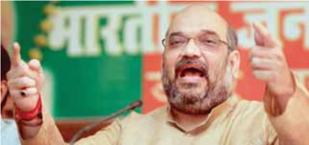
UP BJP in-charge Amit Shah addresses a Press conference at the party office in Lucknow on Thursday

Shah open-heartedly accepted the queries from the scribes and responded to a volley of questions. When asked that despite facing CBI investigation in the Sohrabuddin encounter case he has arrived in UP as party's in-charge, the former Gujarat Home Minister said that barring this there was not even a case of trivial nature against him. “I will come out