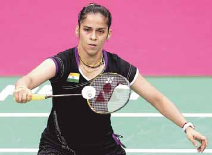
Saina Nehwal in action