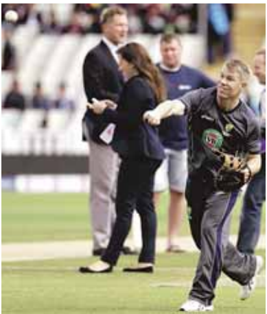
Australia's David Warner is in trouble again

Warner, who played for Delhi Daredevils in the IPL, most recently hit the headlines after being fined 5,750 Australian dollars last month for breaching CA's code of behaviour following his Twitter rant against a cou-