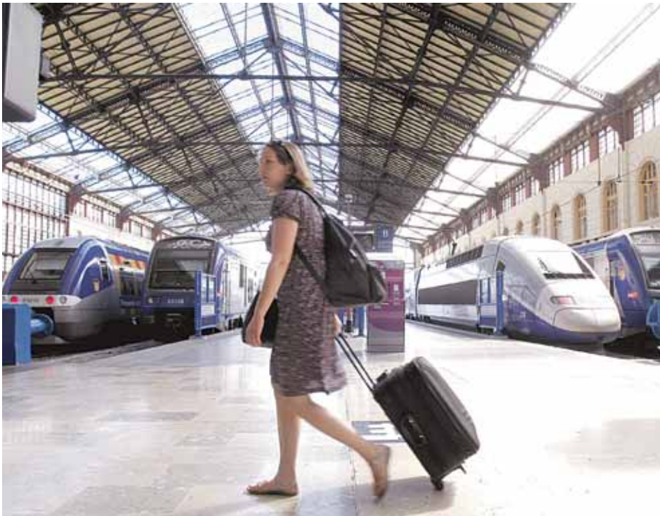
A passenger walks in Saint-Charles railway station, in Marseille, southern France on Thursday as French rail workers strike to protest a reorganization of the national rail and train companies. Up to 70 percent of train journeys in France will be canceled on Thursday. The action began Wednesday night, affecting overnight, international travel and ends Friday morning

At the Interbank Foreign Exchange (Forex) market, rupee resumed sharply lower at 58.10 a dollar from previous close of 57.79. It dropped further to a low of 58.56 after hopes of major steps like NRI bond issuance by the government were not announced by Chidambaram in the press conference in New Delhi.