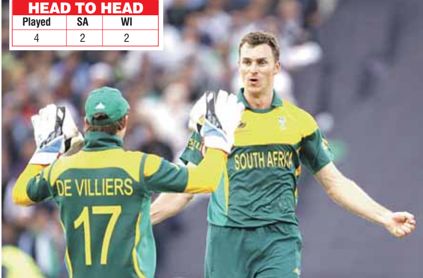
In absence of Dale Steyn, South Africa skipper AB de Villiers (17) has trusted the likes of Ryan McLaren (right) and the right-arm medium fast bowler needs to continue the good work against West Indies on Friday as they possess a lot of aggressive batsmen like Chris Gayle (left).

South Africa have got a shot in the arm ahead of the crucial match with pacer Dale Steyn returning to fitness. He bowled in the nets on Wednesday without any discomfort