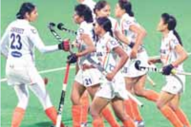
Indian women's team

The Indians though looked impressive in the initial few minutes of the game, they lost their way as the game progressed.