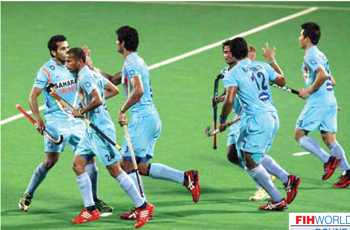
The Indian team face an uphill task in their bid to qualify for the 2014 FIH World Cup

The Indian defence was yet again caught napping by Ireland's fast attack-