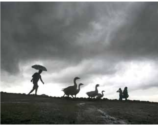
An Indian farmer holding an umbrella walks home with his geese as monsoon clouds hover above in Bhubaneswar on Thursday