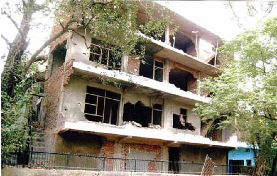
One of the buildings that was partially demolished on Thursday by NMC