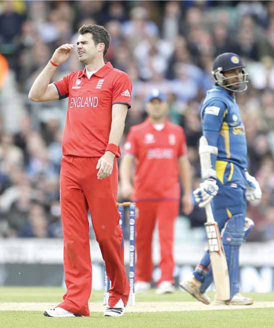
England's James Anderson (left) reacts after bowling to Sri Lanka's Kumar Sangakkara during their ICC Champions Trophy match at the Oval cricket ground in London on Thursday