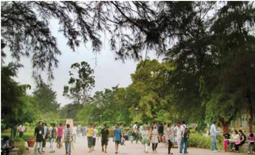
Students enjoy pleasant weather in DU on Thursday

would be considered and a total of 70 per cent for admission would depend on the marks in Class 12,” she added and also highlighted the areas in the job market for foreign languages. Students get easily hired by MNCs as language experts and consultants, school teachers, translators, interpreters, tourist coordinators and also foreign embassys have a lot of space for them. There are about 23 faculty members catering in this department and about 20 college of the Delhi University offer honours course in these four languages. At the Department, they also run a certificate course in Romanian and Portugese. From this year, the following colleges would offer French, German, and Spanish as Discipline II courses. The Jesus and Mary College will have French and Spanish, the Delhi College of Arts and Commerce will have German and Spanish, Gargi College French and Ramanujan College too will have Frence.