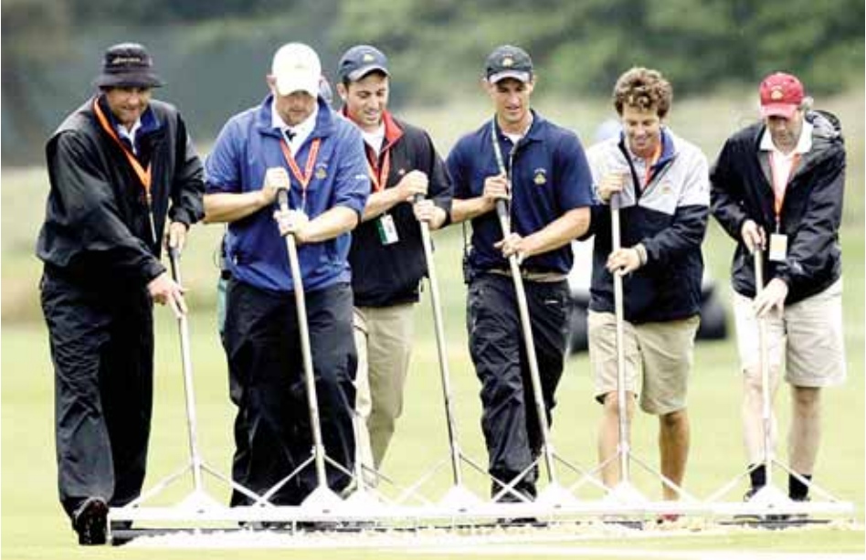
Rainy weather marred the opening day's play at US Open

Safety was a concern on a course that required fans to take long shuttle rides from remote parking lots. At a fan zone,