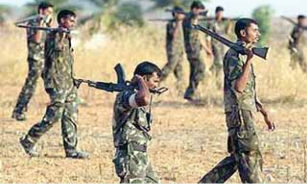
Top Congress leaders have assured the party workers that adequate security will be provided to them during the Parivartan Yatra. Rahul himself has taken up the issue with the Home Minister urging him to provide adequate central paramilitary forces for it

The Congress feels that the high voting percentage of 80 to 85 per cent in the forest regions during the last assembly polls indicated that elections were