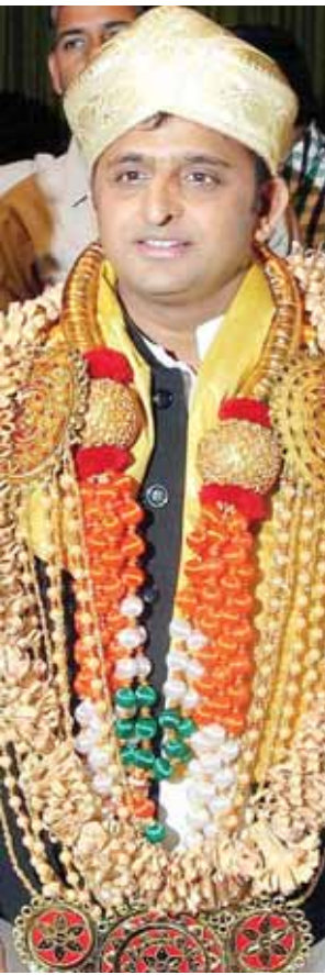
Uttar Pradesh Chief Minister Akhilesh Yadav wears a Mysore Peta and garlands presented to him by Samajwadi Party workers during a party meeting in Bangalore on Thursday

Yadav said UP has always restricted communal parties which try to divide the society and nation at large. Asked for his reaction on the elevation of Modi, Yadav said the SP has always faced communal forces and UP has always supported secular parties. He further said the people in UP have always taken prudent decisions on issues of secularism,